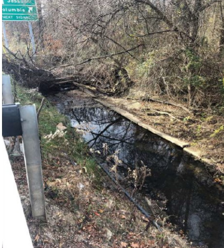
D7 MD 108 at Lark Brown Rd, Howard County, 7 Dec 2021, HO319 Stream out of flume and eroding slope, debris blockage, sign foundation exposed, unknown utility exposed