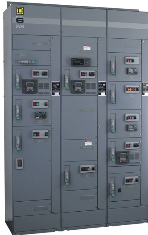
Proposed replacement model MCC. Square D Model 6