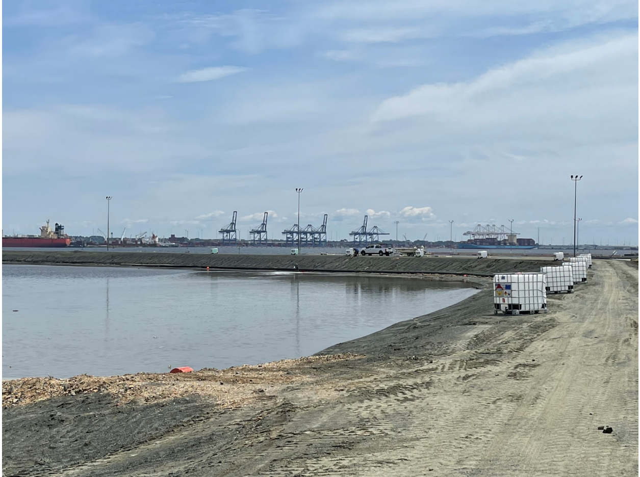
PHOTO: Algaecide Totes at the Masonville DMCF ready for application