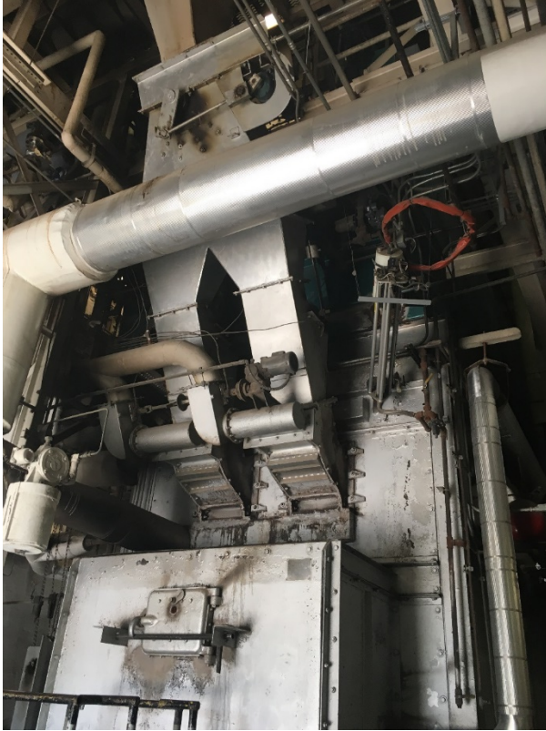
Boiler #2 at ECI Cogeneration Plant (view from front – shows firebox and wood chutes)