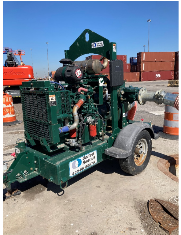
Pump, Dundalk Marine Terminal