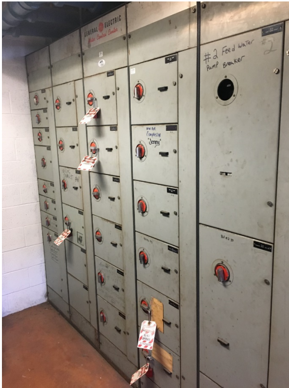
Existing MCC 'A' at the MCI-Hagerstown Boiler Plant.

The original contract agreement directed the A/E to deliver the design documents in two separate bid packages for a construction delivery in two phases (Phases 1 & 2). Due to extensive equipment lead times of up to a year, a single bid package was determined to be prudent to allow a single awarded contractor to plan the construction schedule. In so doing, the intention of the phased construction can be maintained, minimize power outages in support of the boiler plant’s continuous operating mission in a safe, reliable, and efficient manner.