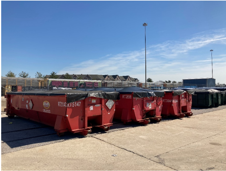
Roll off box, Dundalk Marine Terminal