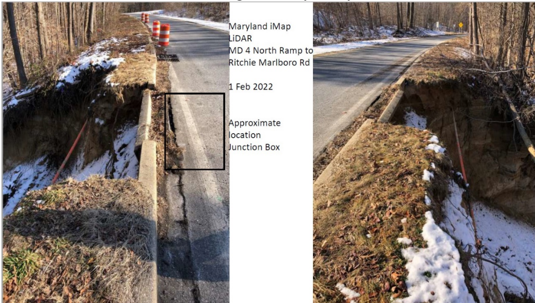
Image 1: Emergency design and repair- MD Route 4 Ramp to Ritchie-Marlboro Road Prince George's County, Maryland

requested that MES obtain additional capacity for emergency storm water repair work by establishing a new contract with another construction contractor. Allied Contractors, Inc., has experience working with SHA and currently is the contractor for MDOT-SHA 440D31423. SHA anticipates that new, additional emergency storm water system repair work will be identified for MES assignment in the next several months with the spring rains.