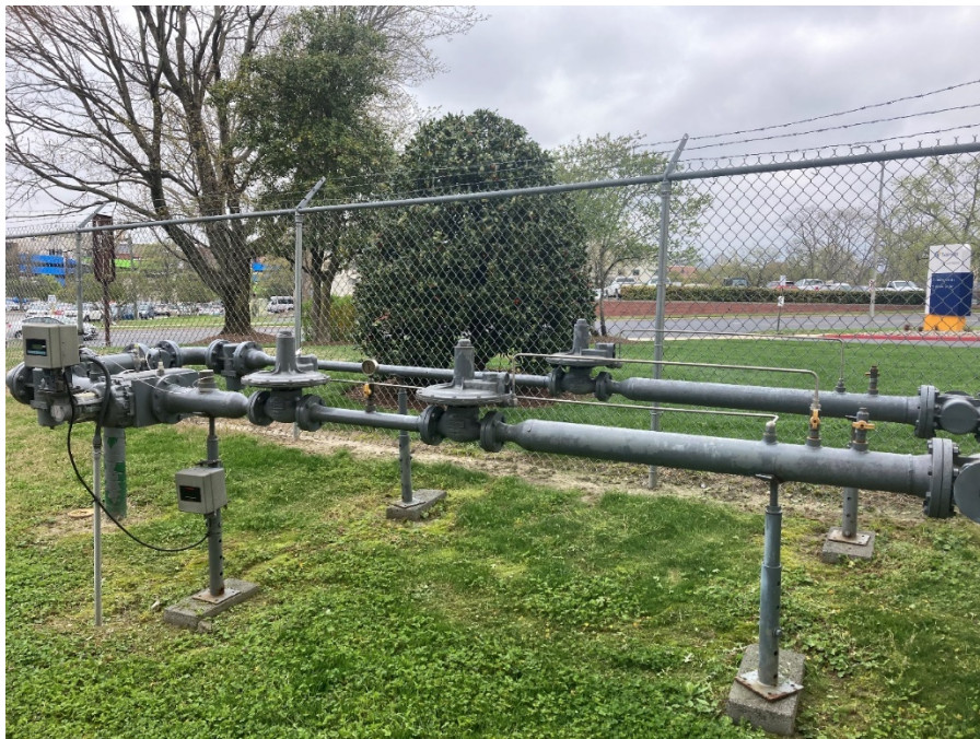
Natural Gas Monitoring Station – TidalHealth Peninsula Regional in Salisbury, MD (similar distribution point installation to this contract)