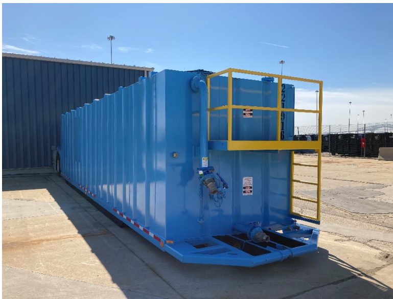
Frac tank, Dundalk Marine Terminal