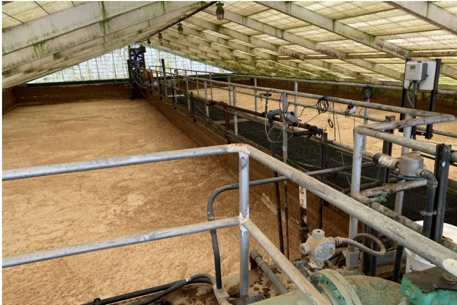
Image No. 3: Preliminary and primary treatment units (Primary Clarifier, Equalization, Neutralization, and Flocculation Tanks) and sludge processing units (Thickener, Sludge Holding and Conditioning Tanks, Plate and Frame Press) housed inside the Pre-Treatment Facility