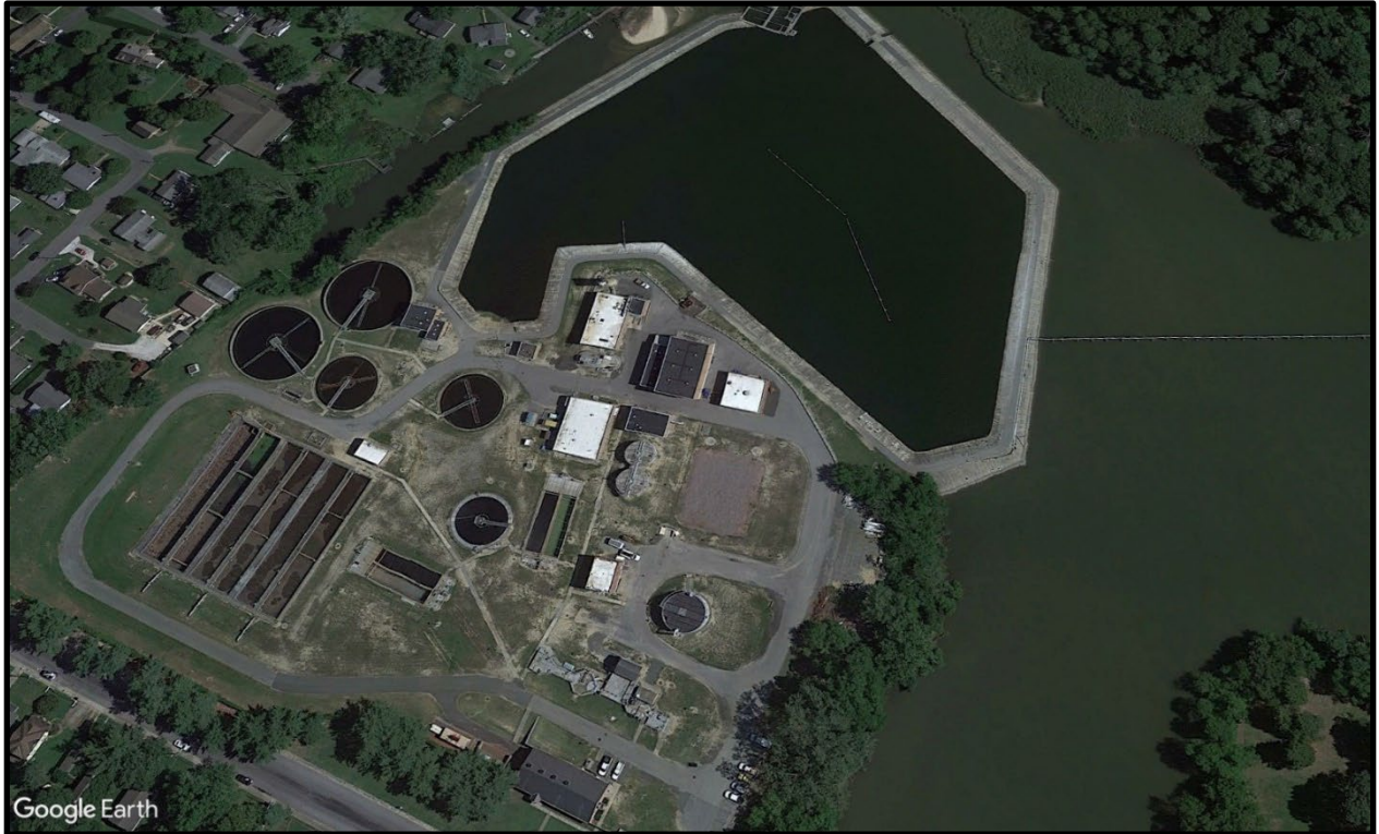
CITY OF CAMBRIDGE WASTEWATER TREATMENT PLANT

dewatered sludge from the WWTP to Dorchester County Landfill for disposal.